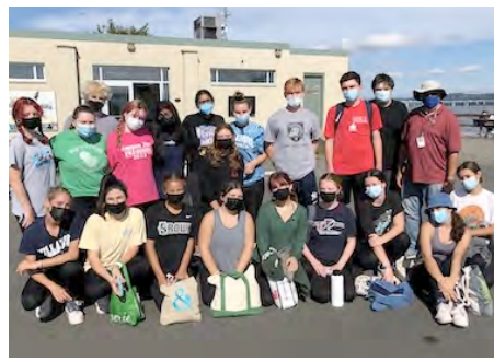
Tappan Zee High School

Location: Piermont Pier, Piermont, Rockland, NY