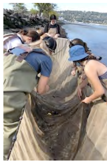
Seining & Fish ID with Clarkstown