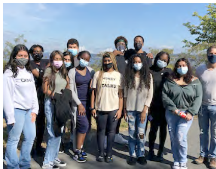
Spring Valley High School

Latitude 41.043189 N & Longitude – 73.89595 W